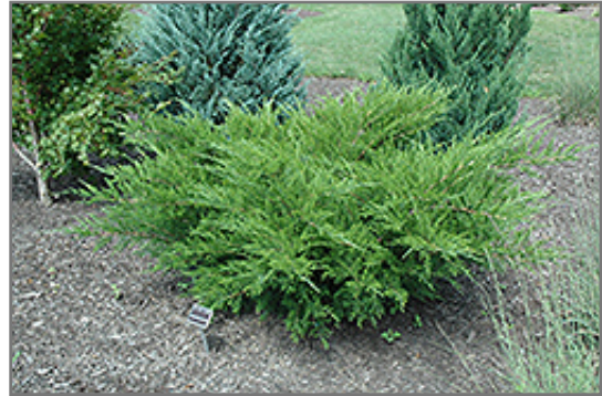
Sea Green Juniper