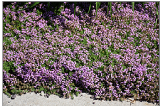
Elfin Creeping Thyme in bloom