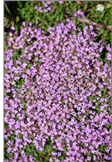
Elfin Creeping Thyme flowers