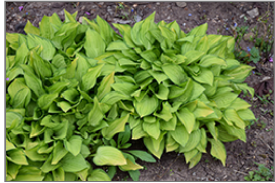
Emerald Tiara Hosta

Emerald Tiara Hosta is recommended for the following landscape applications;