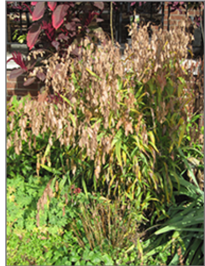
Northern Sea Oats

Northern Sea Oats is a fine choice for the garden, but it is also a good selection for planting in outdoor pots and containers. Because of its height, it is often used as a 'thriller' in the 'spiller-thriller-filler' container combination; plant it near the center of the pot, surrounded by smaller plants and those that spill over the edges. It is even sizeable enough that it can be grown alone in a suitable container. Note that when growing plants in outdoor containers and baskets, they may require more frequent waterings than they would in the yard or garden.