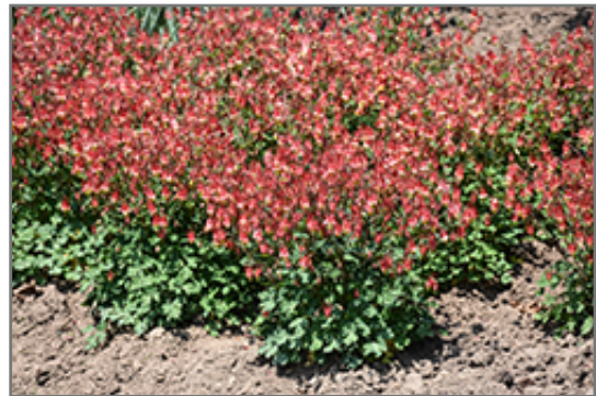
Little Lanterns Columbine in bloom