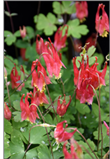
Little Lanterns Columbine flowers

Little Lanterns Columbine is a fine choice for the garden, but it is also a good selection for planting in outdoor pots and containers. It is often used as a 'filler' in the 'spiller-thriller-filler' container combination, providing a mass of flowers and foliage against which the larger thriller plants stand out. Note that when growing plants in outdoor containers and baskets, they may require more frequent waterings than they would in the yard or garden.