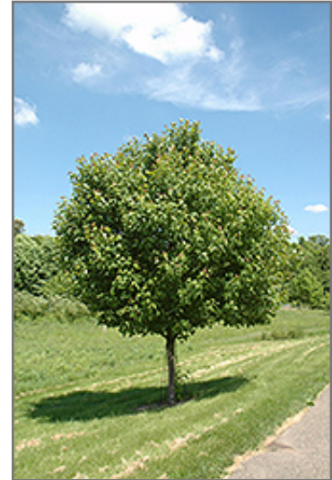
Northwood Red Maple

This tree should only be grown in full sunlight. It is quite adaptable, preferring to grow in average to wet conditions, and will even tolerate some standing water. It is not particular as to soil type, but has a definite preference for acidic soils, and is subject to chlorosis (yellowing) of the foliage in alkaline soils. It is somewhat tolerant of urban pollution. This is a selection of a native North American species.