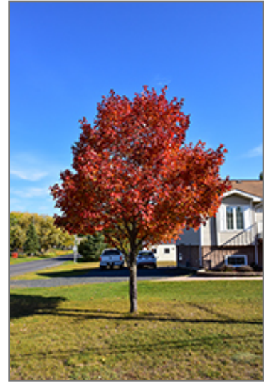
Northwood Red Maple in fall