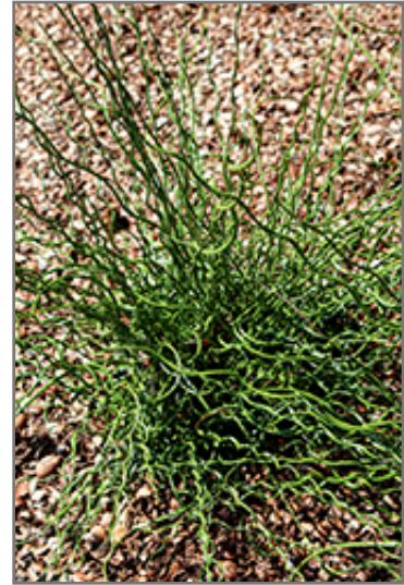
Curly Wurly Corkscrew Rush