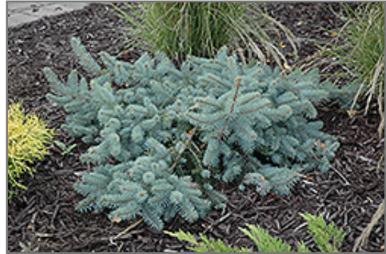
Procumbens Spruce

Procumbens Spruce is recommended for the following landscape applications;