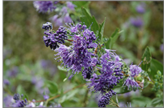
Blue Mist Caryopteris flowers

Blue Mist Caryopteris is recommended for the following landscape applications;