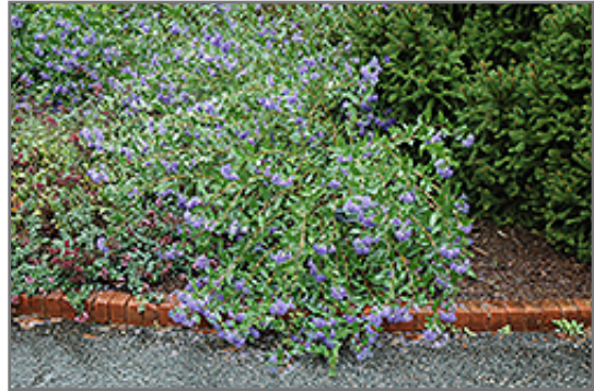
Blue Mist Caryopteris in bloom

Blue Mist Caryopteris will grow to be about 3 feet tall at maturity, with a spread of 3 feet. It tends to fill out right to the ground and therefore doesn't necessarily require facer plants in front. It grows at a medium rate, and under ideal conditions can be expected to live for approximately 20 years.