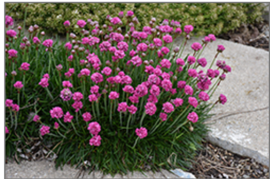
Bloodstone Sea Thrift in bloom