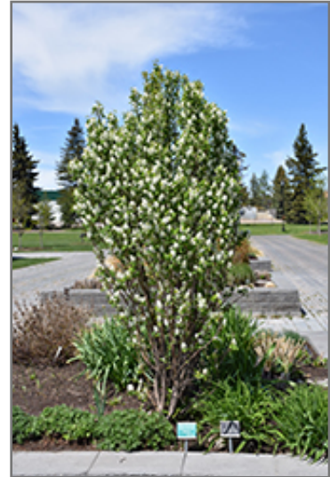
Standing Ovation Saskatoon Berry in bloom