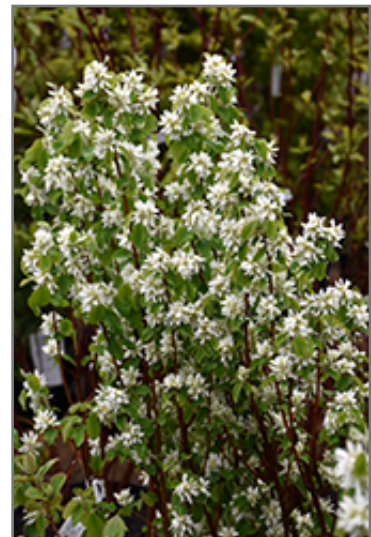
Standing Ovation Saskatoon Berry flowers