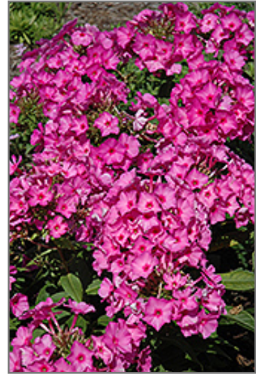
Flame Pink Garden Phlox flowers