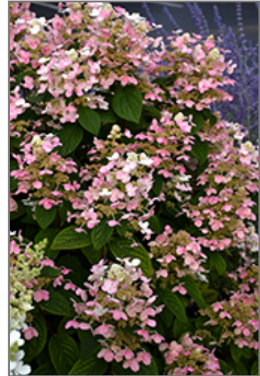
Quick Fire Hydrangea flowers