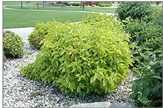
Prairie Fire Dogwood