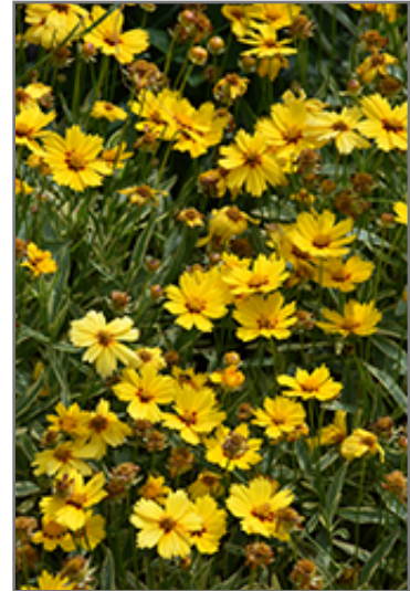
Tequila Sunrise Tickseed flowers