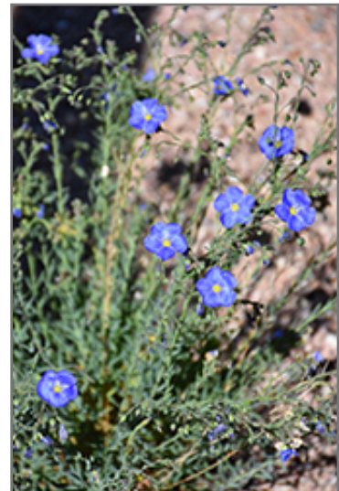
Wild Blue Flax flowers