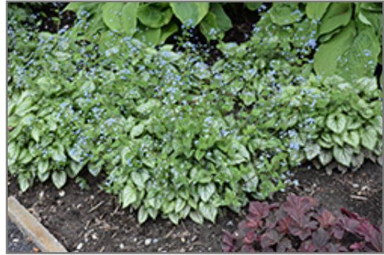
Jack Frost Bugloss in bloom

Jack Frost Bugloss will grow to be about 12 inches tall at maturity extending to 16 inches tall with the flowers, with a spread of 18 inches. When grown in masses or used as a bedding plant, individual plants should be spaced approximately 14 inches apart. It grows at a medium rate, and under ideal conditions can be expected to live for approximately 10 years. As an herbaceous perennial, this plant will usually die back to the crown each winter, and will regrow from the base each spring. Be careful not to disturb the crown in late winter when it may not be readily seen!