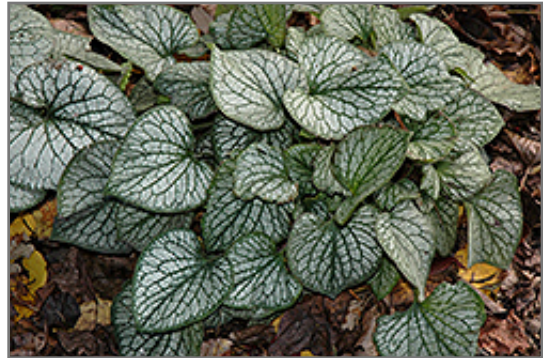
Jack Frost Bugloss foliage