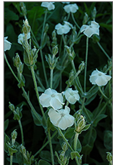
White Rose Campion flowers