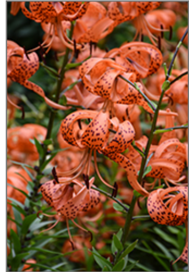
Tiger Lily flowers