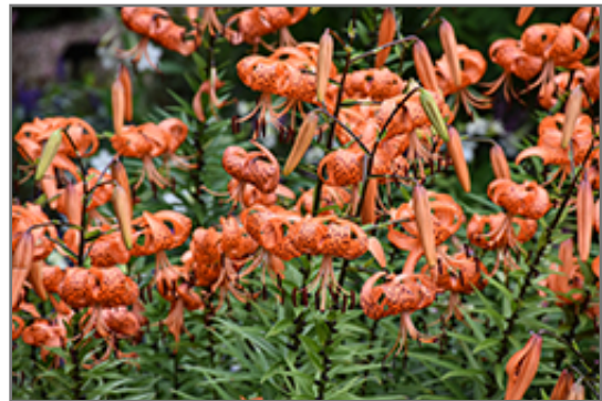
Tiger Lily flowers