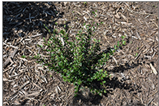
Autumn Inferno Cotoneaster