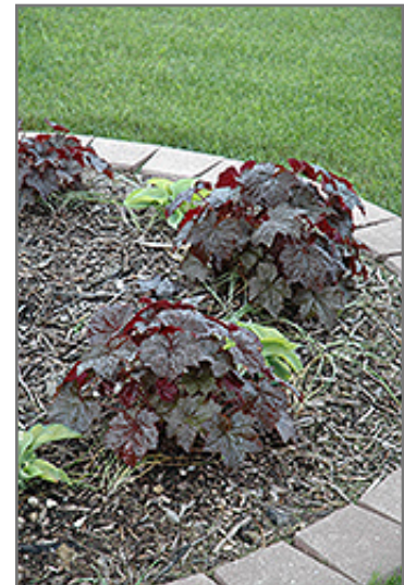
Palace Purple Coral Bells