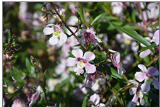
Pinstripe Vintage Pink Angelonia flowers