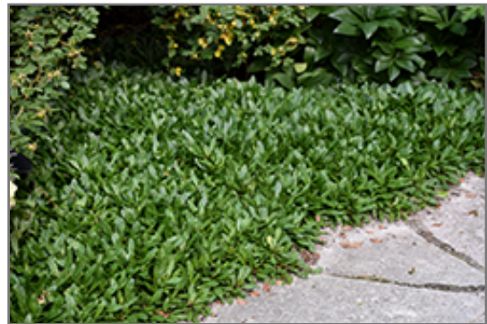
Emerald Chip Bugleweed