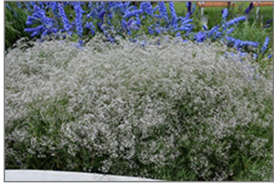
Common Baby's Breath in bloom