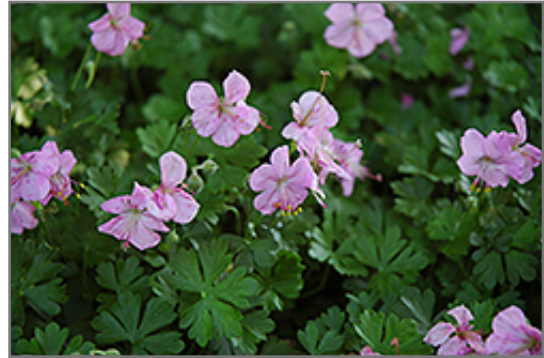
Dalmatian Cranesbill flowers

Dalmatian Cranesbill is recommended for the following landscape applications;