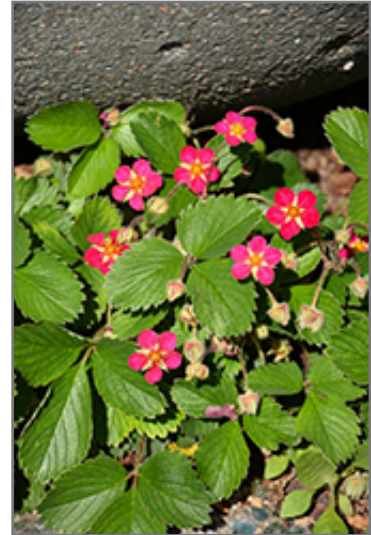
Lipstick Strawberry flowers

Lipstick Strawberry has masses of beautiful cherry red daisy flowers with yellow eyes along the stems from late spring to early summer, which are most effective when planted in groupings. Its tomentose round compound leaves remain green in color throughout the season. It features an abundance of magnificent red berries from mid spring to mid fall.