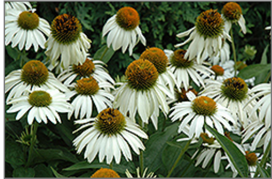
White Swan Coneflower flowers

White Swan Coneflower is recommended for the following landscape applications;