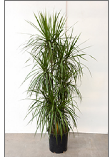
Red-edge Dracaena

When grown indoors, Red-edge Dracaena can be expected to grow to be about 8 feet tall at maturity, with a spread of 4 feet. It grows at a medium rate, and under ideal conditions can be expected to live for approximately 10 years. This houseplant performs well in both bright or indirect sunlight and strong artificial light, and can therefore be situated in almost any well-lit room or location. It does best in average to evenly moist soil, but will not tolerate standing water. The surface of the soil shouldn't be allowed to dry out completely, and so you should expect to water this plant once and possibly even twice each week. Be aware that your particular watering schedule may vary depending on its location in the room, the pot size, plant size and other conditions; if in doubt, ask one of our experts in the store for advice. It is not particular as to soil type or pH; an average potting soil should work just fine.