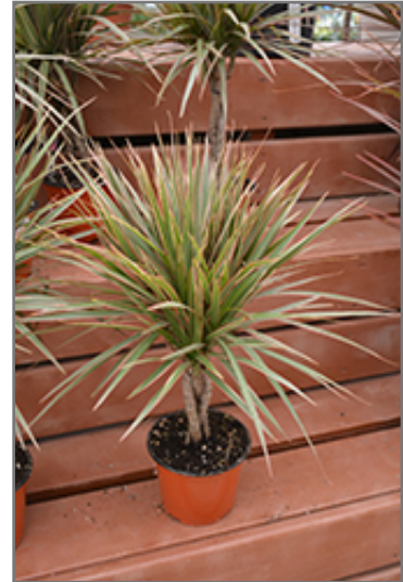
Colorama Dracaena in full

When grown indoors, Colorama Dracaena can be expected to grow to be about 3 feet tall at maturity, with a spread of 24 inches. It grows at a medium rate, and under ideal conditions can be expected to live for approximately 10 years. This houseplant performs well in both bright or indirect sunlight and strong artificial light, and can therefore be situated in almost any well-lit room or location. It does best in average to evenly moist soil, but will not tolerate standing water. The surface of the soil shouldn't be allowed to dry out completely, and so you should expect to water this plant once and possibly even twice each week. Be aware that your particular watering schedule may vary depending on its location in the room, the pot size, plant size and other conditions; if in doubt, ask one of our experts in the store for advice. It is not particular as to soil type or pH; an average potting soil should work just fine.