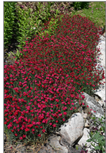
Flashing Light Maiden Pinks in bloom