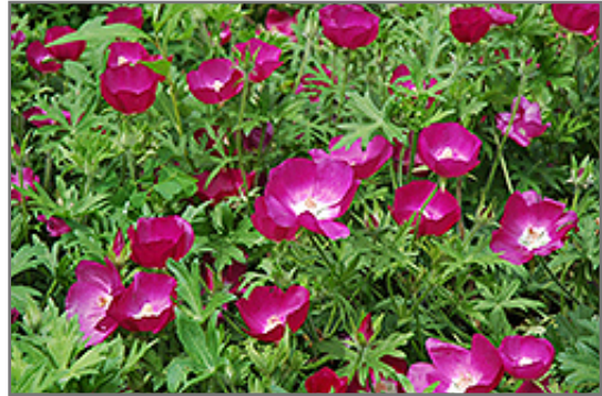
Purple Poppymallow flowers