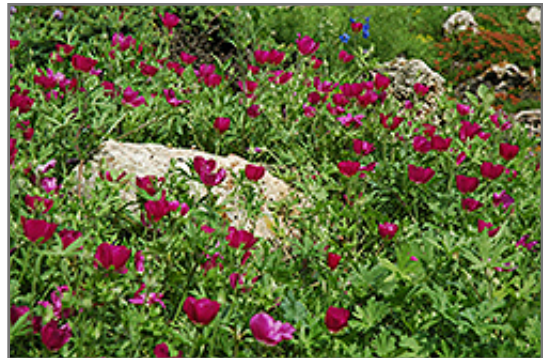
Purple Poppymallow flowers