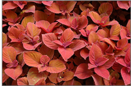
Campfire Coleus foliage