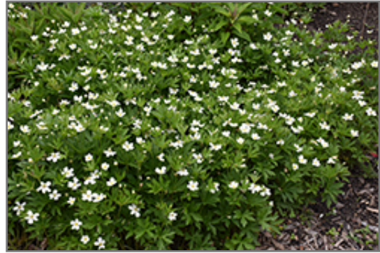
Windflower in bloom

Windflower will grow to be about 12 inches tall at maturity, with a spread of 18 inches. Its foliage tends to remain dense right to the ground, not requiring facer plants in front. It grows at a fast rate, and under ideal conditions can be expected to live for approximately 10 years. As an herbaceous perennial, this plant will usually die back to the crown each winter, and will regrow from the base each spring. Be careful not to disturb the crown in late winter when it may not be readily seen!