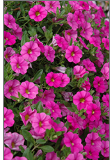
MiniFamous Neo Pink Calibrachoa flowers

This plant will require occasional maintenance and upkeep. Trim off the flower heads after they fade and die to encourage more blooms late into the season. It is a good choice for attracting bees and hummingbirds to your yard, but is not particularly attractive to deer who tend to leave it alone in favor of tastier treats. It has no significant negative characteristics.