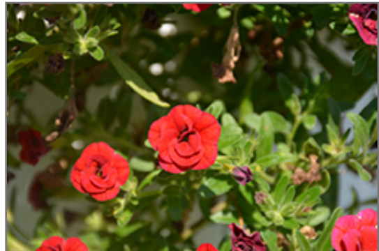
MiniFamous Double Compact Red Calibrachoa flowers