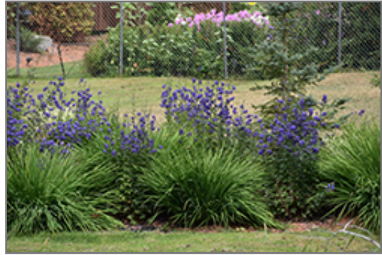
Common Monkshood in bloom

Common Monkshood will grow to be about 3 feet tall at maturity extending to 4 feet tall with the flowers, with a spread of 24 inches. It tends to be leggy, with a typical clearance of 1 foot from the ground, and should be underplanted with lower-growing perennials. The flower stalks can be weak and so it may require staking in exposed sites or excessively rich soils. It grows at a medium rate, and under ideal conditions can be expected to live for approximately 15 years. As an herbaceous perennial, this plant will usually die back to the crown each winter, and will regrow from the base each spring. Be careful not to disturb the crown in late winter when it may not be readily seen!