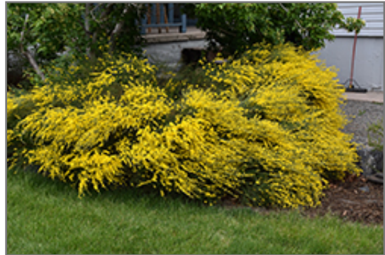
Spanish Gold Broom in bloom