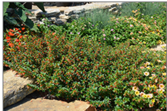
Vermillionaire Large Firecracker Plant in bloom