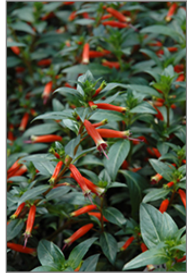
Vermillionaire Large Firecracker Plant flowers

Vermillionaire Large Firecracker Plant is a fine choice for the garden, but it is also a good selection for planting in outdoor pots and containers. With its upright habit of growth, it is best suited for use as a 'thriller' in the 'spiller-thriller-filler' container combination; plant it near the center of the pot, surrounded by smaller plants and those that spill over the edges. It is even sizeable enough that it can be grown alone in a suitable container. Note that when growing plants in outdoor containers and baskets, they may require more frequent waterings than they would in the yard or garden.