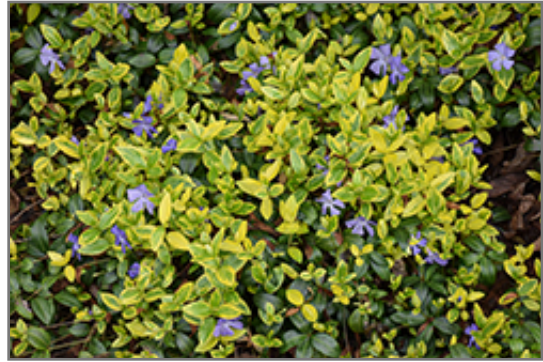
Illumination Periwinkle in bloom