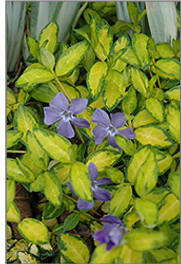
Illumination Periwinkle flowers

Illumination Periwinkle is a fine choice for the garden, but it is also a good selection for planting in outdoor pots and containers. Because of its spreading habit of growth, it is ideally suited for use as a 'spiller' in the 'spiller-thriller-filler' container combination; plant it near the edges where it can spill gracefully over the pot. Note that when growing plants in outdoor containers and baskets, they may require more frequent waterings than they would in the yard or garden.