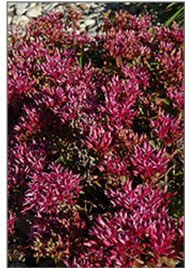
Dragon's Blood Stonecrop in bloom

Dragon's Blood Stonecrop is a fine choice for the garden, but it is also a good selection for planting in outdoor pots and containers. Because of its spreading habit of growth, it is ideally suited for use as a 'spiller' in the 'spiller-thriller-filler' container combination; plant it near the edges where it can spill gracefully over the pot. Note that when growing plants in outdoor containers and baskets, they may require more frequent waterings than they would in the yard or garden.