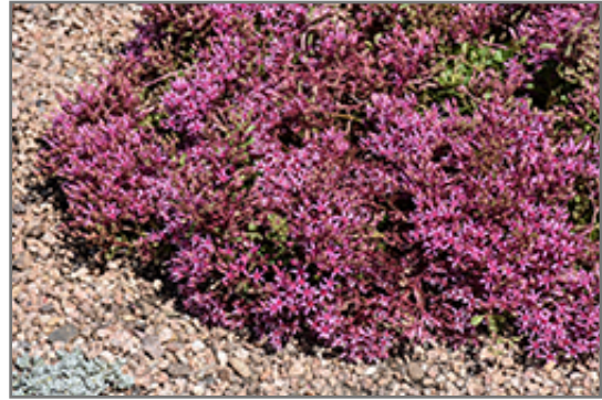
Dragon's Blood Stonecrop flowers

This plant will require occasional maintenance and upkeep, and is best cleaned up in early spring before it resumes active growth for the season. Deer don't particularly care for this plant and will usually leave it alone in favor of tastier treats. Gardeners should be aware of the following characteristic(s) that may warrant special consideration;