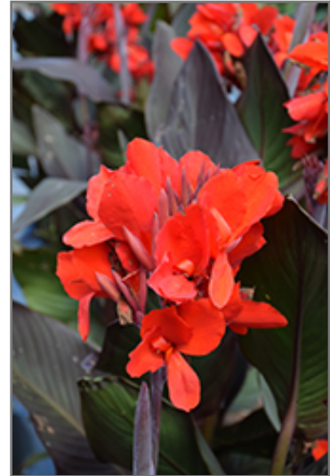
Cannova Bronze Scarlet Canna flowers

This plant is native to the tropics and prefers growing in moist environments with evenly warm conditions all year round. In our climate, it is usually grown as an outdoor annual in the garden or in a container. If you want it to survive the winter, it can be brought in to the house and provided with special care, and then returned to the garden the following season. In its preferred tropical habitat, it can grow to be around 4 feet tall at maturity, with a spread of 20 inches. However, when grown as an annual or when overwintered indoors, it can be expected to perform differently, and its exact height and spread will depend on many factors; you may wish to consult with our experts as to how it might perform in your specific application and growing conditions.