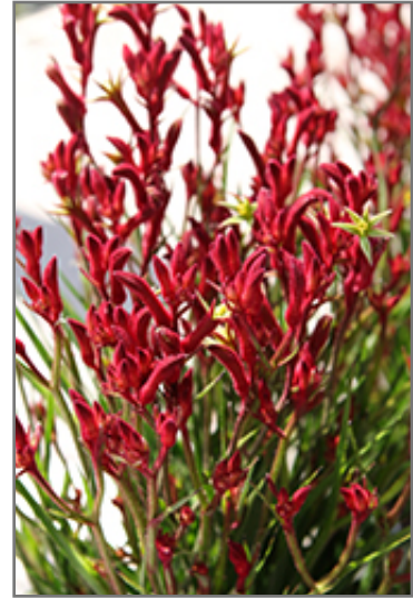
Big Red Kangaroo Paw flowers