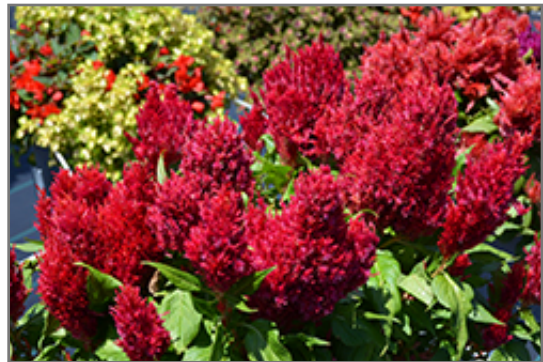
First Flame Red Celosia flowers