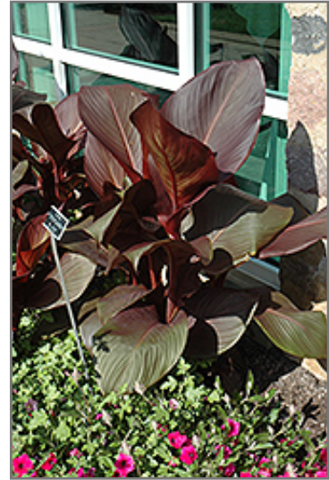
Tropicanna Black Canna

This plant is native to the tropics and prefers growing in moist environments with evenly warm conditions all year round. In our climate, it is usually grown as an outdoor annual in the garden or in a container. If you want it to survive the winter, it can be brought in to the house and provided with special care, and then returned to the garden the following season. In its preferred tropical habitat, it can grow to be around 5 feet tall at maturity, with a spread of 24 inches. However, when grown as an annual or when overwintered indoors, it can be expected to perform differently, and its exact height and spread will depend on many factors; you may wish to consult with our experts as to how it might perform in your specific application and growing conditions.