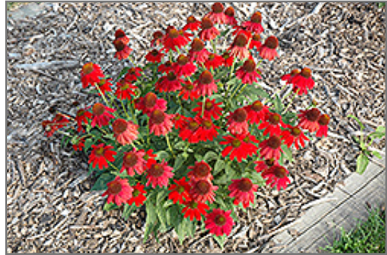
Sombrero Salsa Red Coneflower in bloom

Sombrero Salsa Red Coneflower will grow to be about 16 inches tall at maturity extending to 24 inches tall with the flowers, with a spread of 24 inches. Its foliage tends to remain dense right to the ground, not requiring facer plants in front. It grows at a medium rate, and under ideal conditions can be expected to live for approximately 10 years. As an herbaceous perennial, this plant will usually die back to the crown each winter, and will regrow from the base each spring. Be careful not to disturb the crown in late winter when it may not be readily seen!