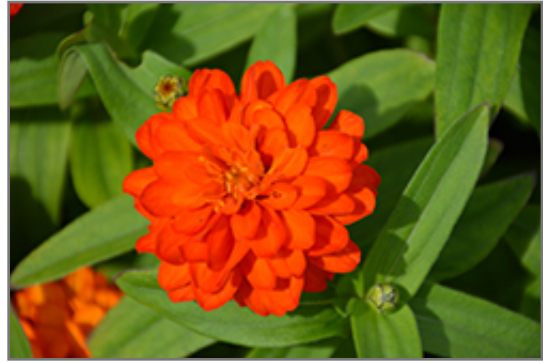
Profusion Double Fire Zinnia flowers