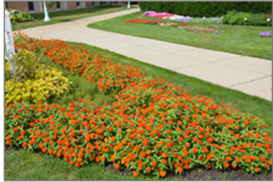
Profusion Double Fire Zinnia in bloom

Profusion Double Fire Zinnia is a fine choice for the garden, but it is also a good selection for planting in outdoor containers and hanging baskets. It is often used as a 'filler' in the 'spiller-thriller-filler' container combination, providing a mass of flowers against which the larger thriller plants stand out. Note that when growing plants in outdoor containers and baskets, they may require more frequent waterings than they would in the yard or garden.