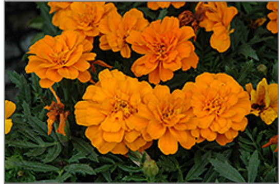
Durango Tangerine Marigold flowers