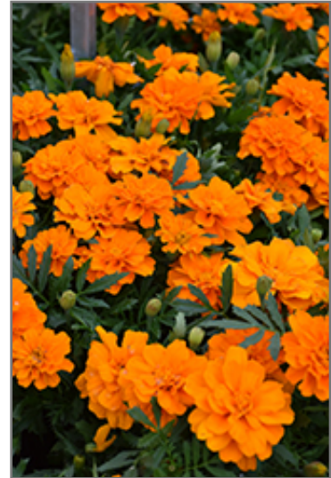
Durango Tangerine Marigold flowers

Durango Tangerine Marigold is a fine choice for the garden, but it is also a good selection for planting in outdoor pots and containers. It is often used as a 'filler' in the 'spiller-thriller-filler' container combination, providing a mass of flowers against which the larger thriller plants stand out. Note that when growing plants in outdoor containers and baskets, they may require more frequent waterings than they would in the yard or garden.