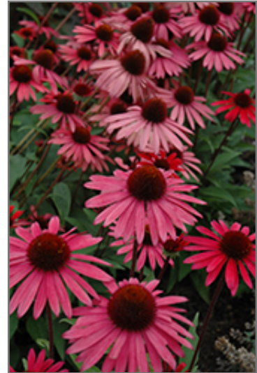
Big Sky Solar Flare Coneflower flowers

This is a relatively low maintenance plant, and is best cleaned up in early spring before it resumes active growth for the season. It is a good choice for attracting butterflies to your yard, but is not particularly attractive to deer who tend to leave it alone in favor of tastier treats. It has no significant negative characteristics.