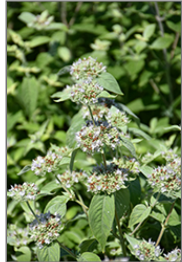
Clustered Mountain Mint flowers

This is a relatively low maintenance plant, and should be cut back in late fall in preparation for winter. It is a good choice for attracting bees and butterflies to your yard, but is not particularly attractive to deer who tend to leave it alone in favor of tastier treats. It has no significant negative characteristics.