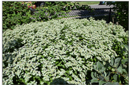
Clustered Mountain Mint in bloom