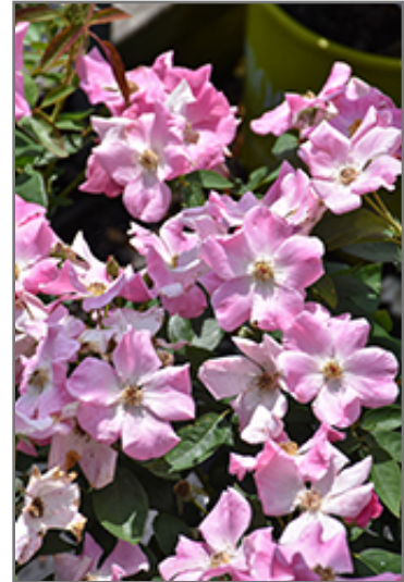
Nearly Wild Rose flowers