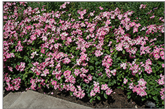
Nearly Wild Rose in bloom